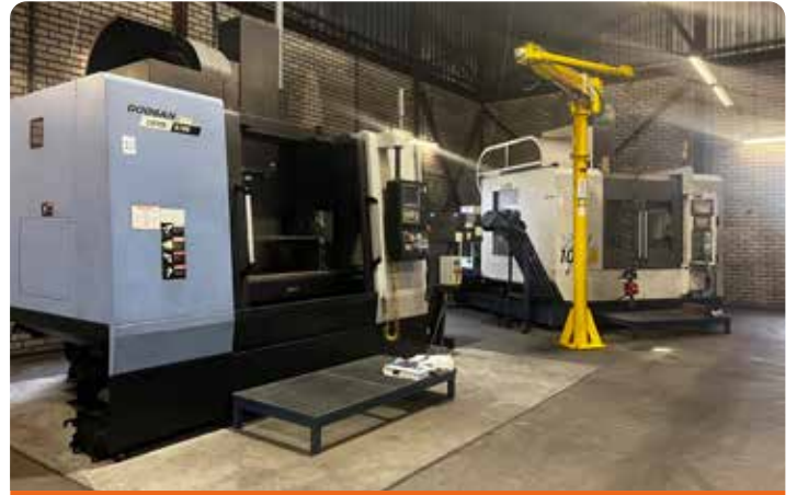
2018 CNC DOOSAN DNM 6700