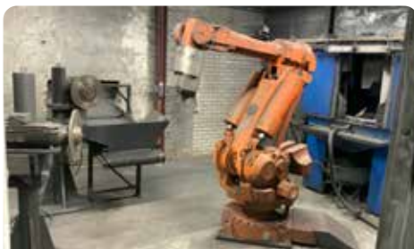
ABB IRB 660 6x CELLS COMPLETE