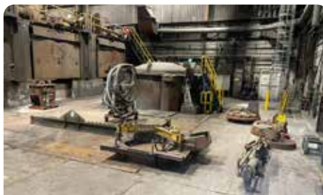
LIFTING MAGNETS, MOBILE BURNERS etc.