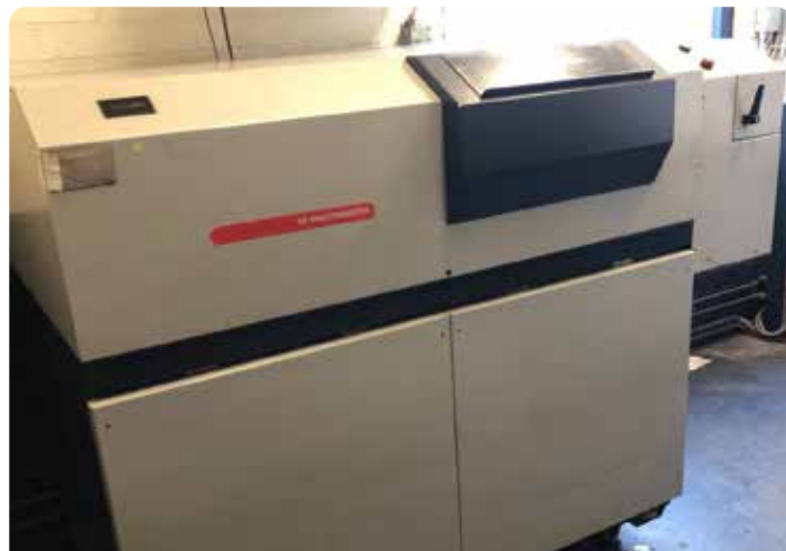
SPECTROPHOTOMETER THERMO ARL 3460

Viewing: Wednesday March 29 th , 10:00-16:00 Location: Lovinkweg 3, 7061 DT, Terborg (NL) Closing: Thursday March 30 th 10:00 GMT+2