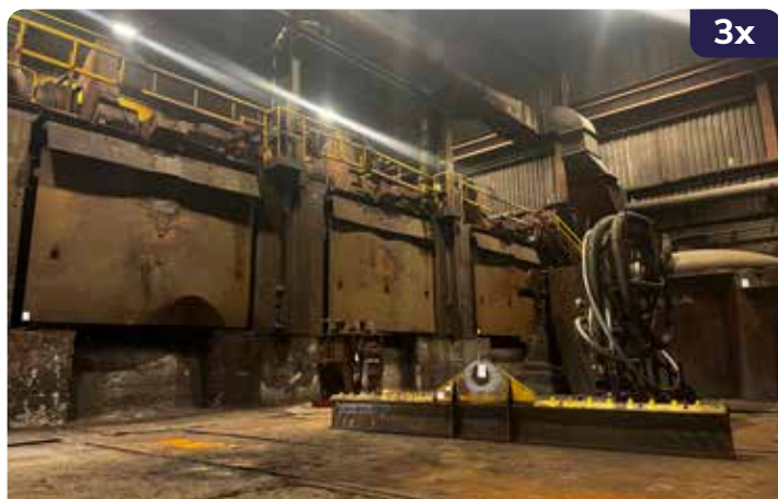
ASEA INDUCTION SMELTING FURNACES HFD-6 (3x)

Modern foundry installations, machines and equipment (i.e. ASEA, SEGAB, DEUCON, WEBAC, WAGNER, DOOSAN PUMA, DECHEL MAHO etc.) due to the closure of the former Foundry Lovink, The Netherlands