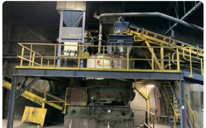
WABAC SAND MIXING & WEIGHING