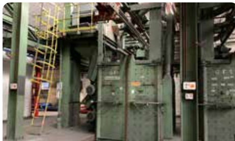
GEORG FISCHER SHOT BLASTING