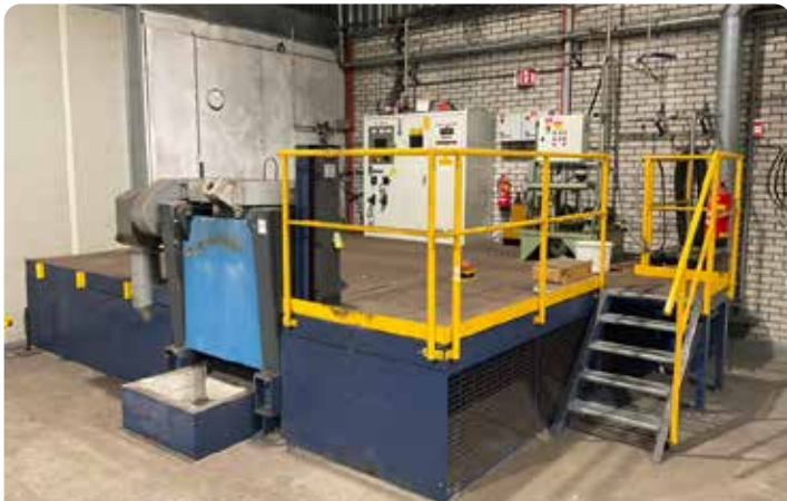
COMPLETE PILOT PLANT VULCAN, INDUCTOTHERM VIP 230-R