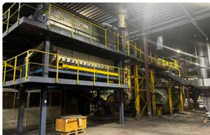
2018/2015 WABAC, VHV, SCHENCK SAND PREPARATION/MIXING