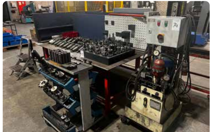
UNIVERSAL MACHINE TOOLS SK40, SK40 etc.