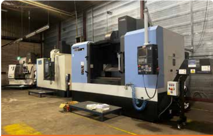
2019 CNC DOOSAN DNM 750 II