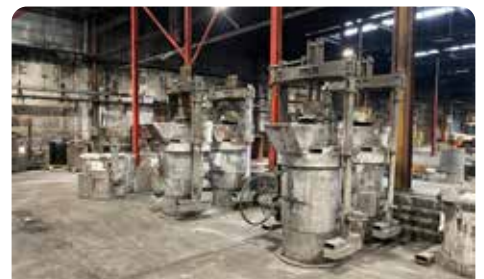
MANY LADLES, CASTING MOLDS etc.