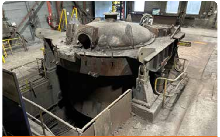
ASEA WARM HOLDER FURNACE