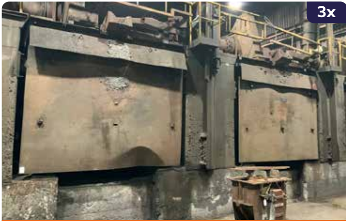
ASEA INDUCTION SMELTING FURNACES HFD-6 (3x)