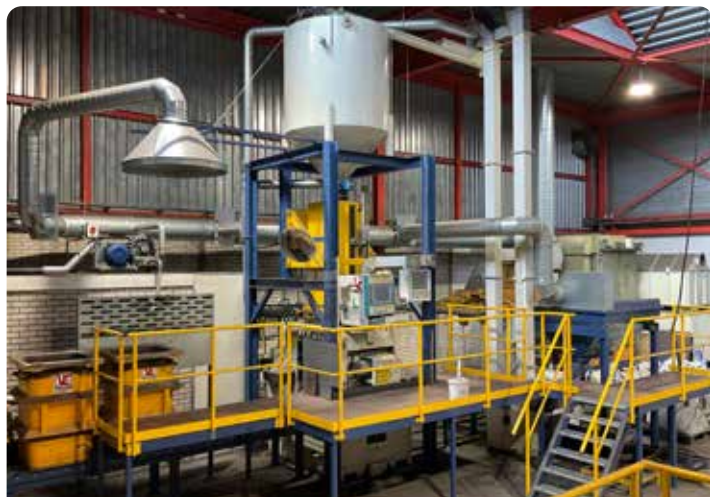
COMPLETE PILOT PLANT VULCAN, INDUCTOTHERM VIP 230-R