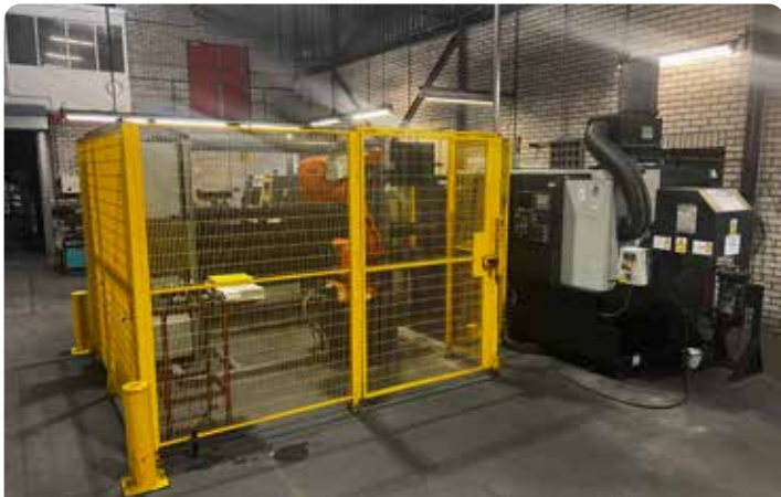
2012 CNC DOOSAN PUMA 2600 MS WITH ROBOT and CELL